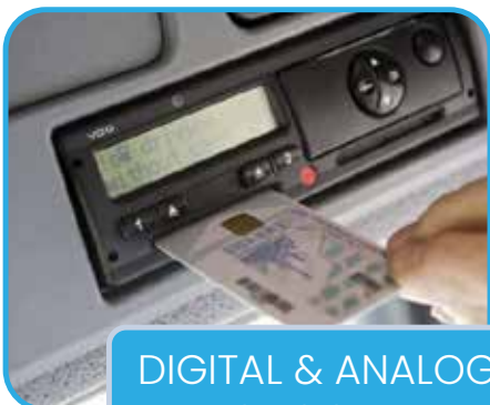
DIGITAL & ANALOG TACHOGRAPH TRAINING