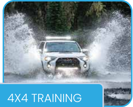
4X4 TRAINING PROGRAM