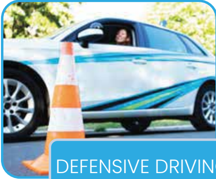
DEFENSIVE DRIVING TRAINING PROGRAM