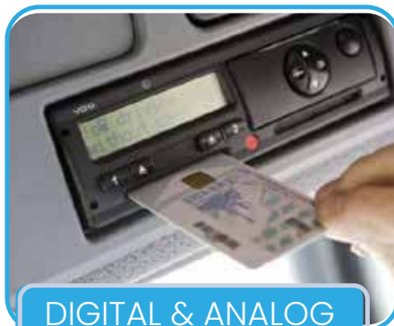
DIGITAL & ANALOG TACHOGRAPH TRAINING