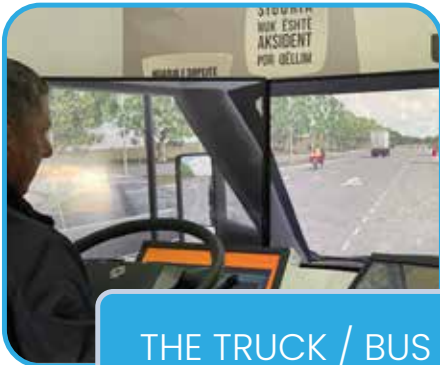
THE TRUCK / BUS SIMULATOR PROGRAM